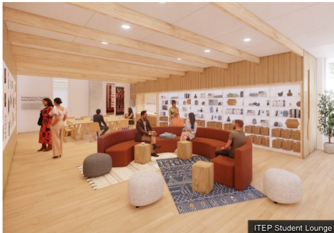
ITEP Student Lounge