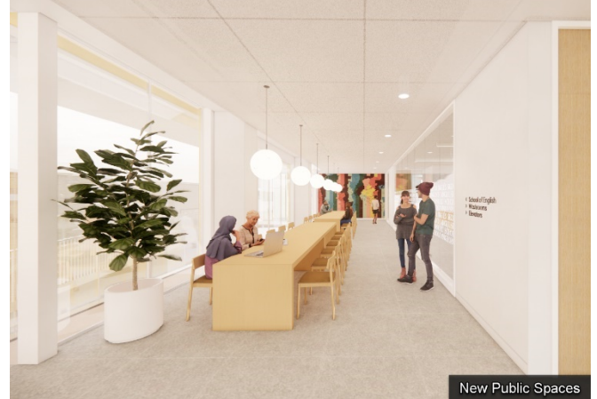
New Public Spaces