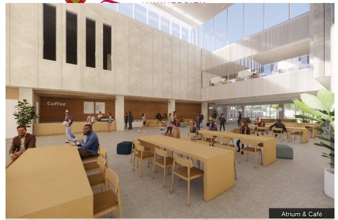
Atrium & Café