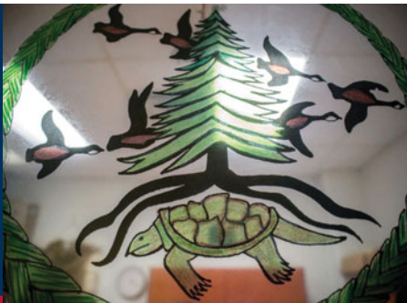
The logo for the Aboriginal Teacher Education Program (ATEP)