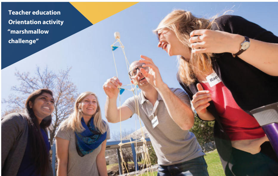
Teacher education Orientation activity "marshmallow challenge"

multiple social events. Our Education Graduate Student Society (EGSS) is an advice, academic, and social group that organizes many events for graduate students. EGSS hosted a lunch connection program to connect students and professors, launched the Works in Progress initiative to support students with proposals, paper and analyses, continued to host ScholarShare and FacultyShare, and held a number of social events for graduate students.