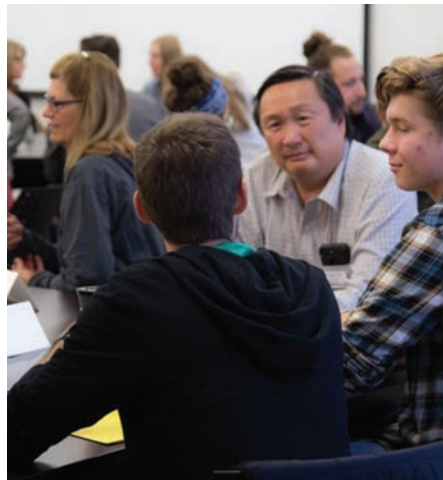
Youth Forum 2019

The Community Cupboard continues to be an important service in the Faculty to support students in need and demonstrates the impact experiential learning projects can have on students, alumni, and the wider community, even after graduation.