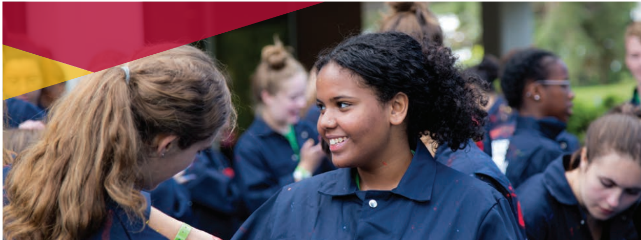
Con-ed students take part in the Queen's tradition of coverall painting