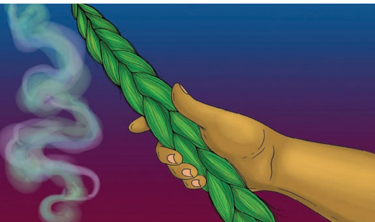
Illustration: Ogimaakwenos by (Chief Lady Bird) for the Research at Queen's website: queensu.ca/research