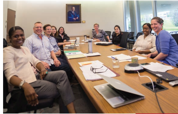
EDI working group summer 2019