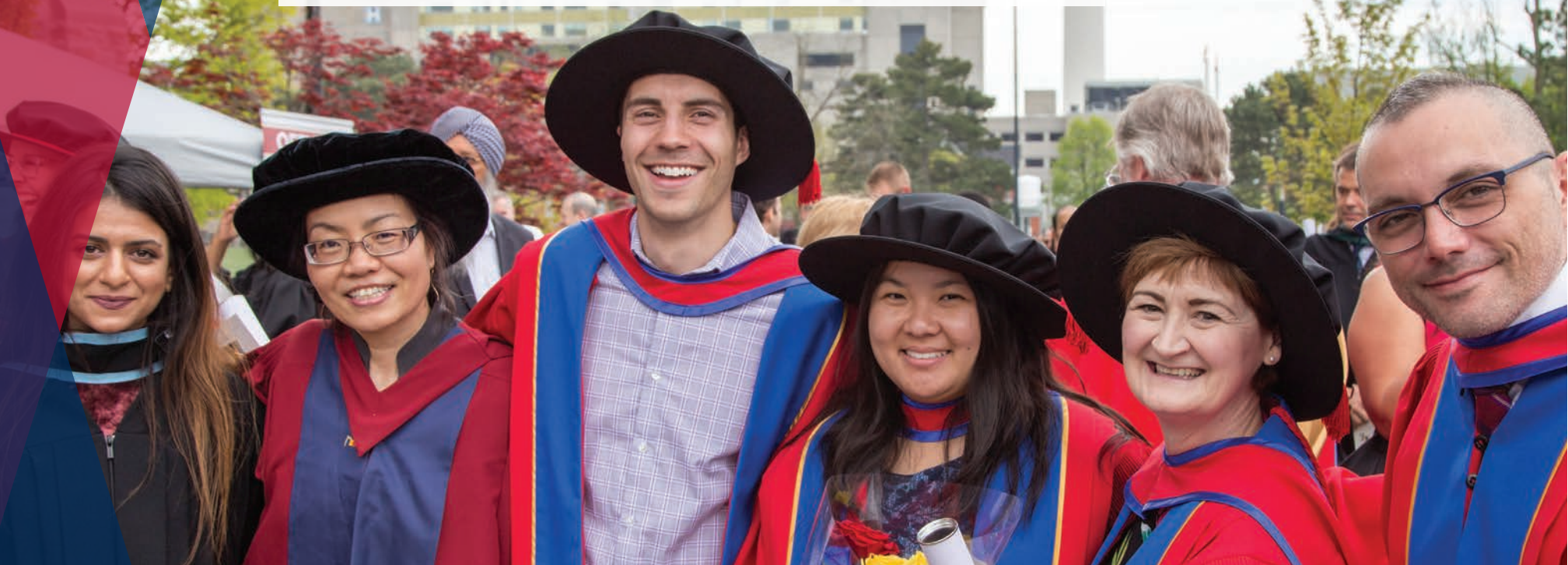
Students and faculty at Convocation