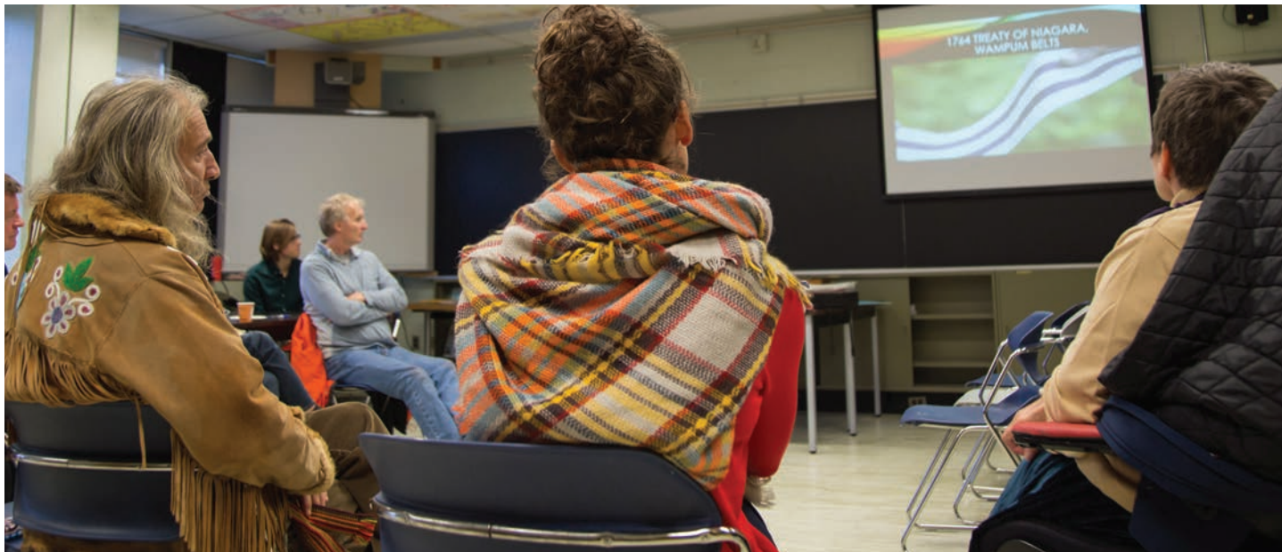
Ever Scholar students in class

Professional Studies has connected with the local community through its Ever Scholar program. Ever Scholar is an open-enrollment course series for anyone in the Kingston area. Designed as a lifelong-learning workshop-style program for all ages, Ever Scholar provides opportunities to explore topics in art, science, and the humanities. The contributions of the local Indigenous communities was essential to the first offering of Ever Scholar, which brought Indigenous knowledge, language, cultures, and history to retirees in Kingston.