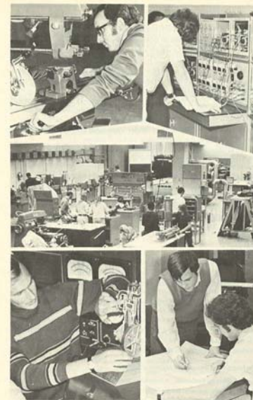
Technical Education — Duncan McArthur Hall.

6 To be eligible for the s.s.o. degree, the Diploma in Technical Education, and any teaching certificate, a student must have grades of Honours, Pass, or No Grade Assigned in all the minimum required components of the program.