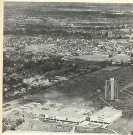
John Royce Hall, Duncan McArthur Hall and the John Orr Tower-West Campus