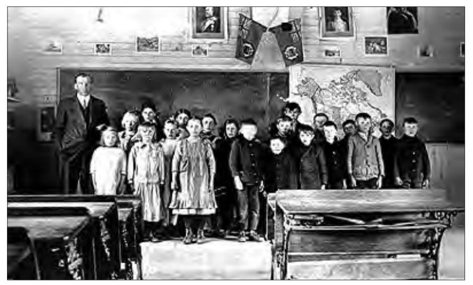
Prairie classroom at Bruderheim, Alberta, 1915.

Students are direct participants in the testing process. Given the impact of large-scale high-stakes testing on students and the diverse backgrounds as well as the particular needs of ELLs, the findings have important implications for test validation and test accommodation for ELLs, and for school boards, policy and government agencies that are instrumental in the education of this growing student population, and for ensuring that this increasingly large group of immigrant and international students have the opportunity to learn(Gee, 2003) in Ontario.