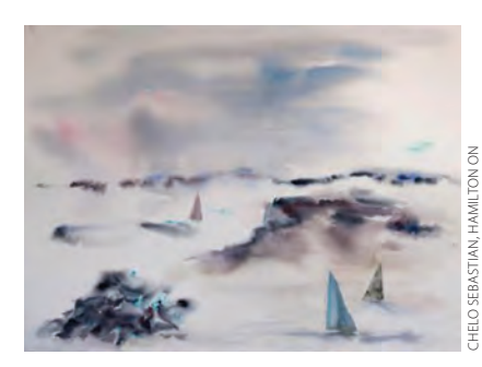
Water Passage by Chelo Sebastian