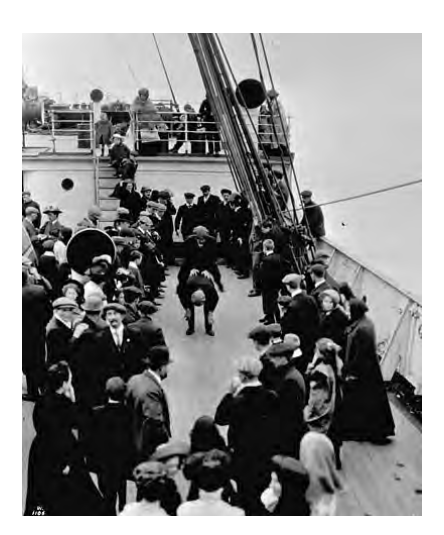
Immigrants playing leap frog on the SS Empress of Britain, ca. 1910