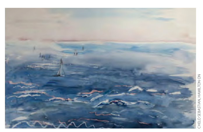
Regatta I by Chelo Sebastian

In conclusion, French is the language that can be taught with the highest number of qualified teachers, the most material, resources, and infrastructure compared to other languages. Moreover, it is, after all, one of the two official languages of Canada. Bilingualism contributes to the unity of the country and French is still an important part of the identity of its people. It would be very dangerous for language learning in general to cut French language programs when we cannot afford to teach other languages. The result could be monolingualism, the opposite of what everyone really wants in Canada.