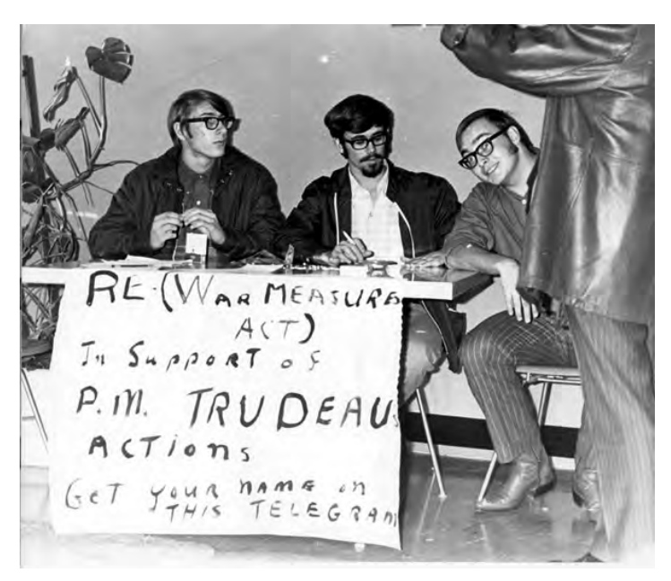
The October Crisis, Québec, 1970